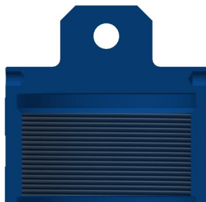
LIFTING BAIL- INTEGRAL TYPE

The RMZ Lifting Bail is safe and efficient way of lifting Wireline Valves/BOP's onto the wellhead. It gives the operator a straight vertical lift, which is essential when connecting quick unions.